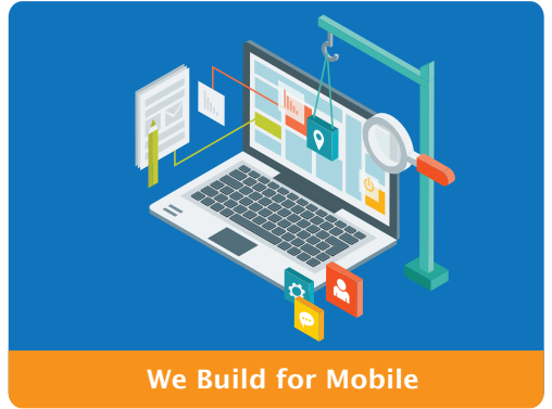
We Build for Mobile