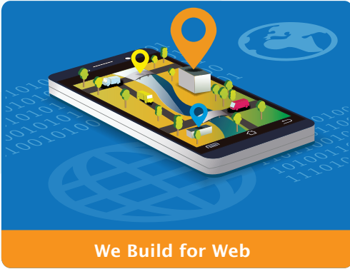
We Build for Web